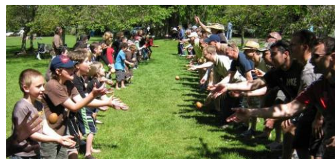
The highly competitive eggstatic egg throwing contest!