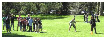
A 20 a side game of softball to complete a great day