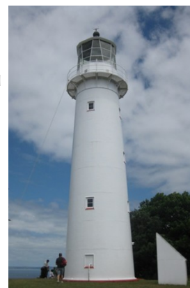
Tiri Tiri Lighthouse