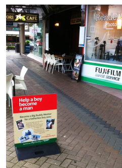
New signage on Hurstmere Road